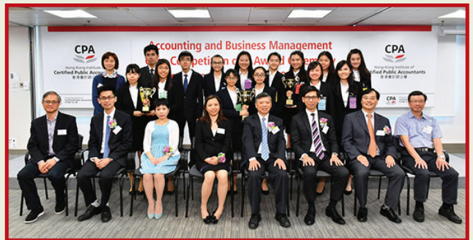
2 Winning teams with honourable guests.