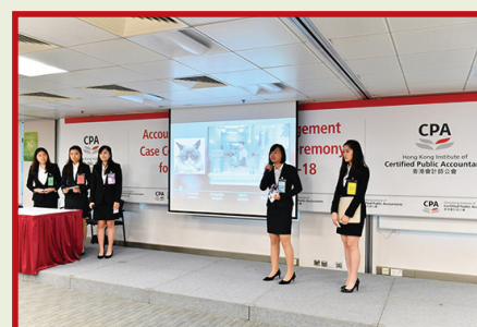
6 1 st runner-up team presenting their business proposal to the audience.