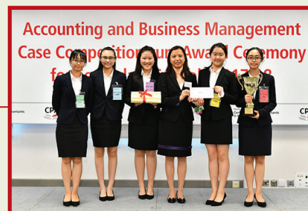
5 Champion team