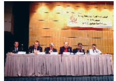
Annual Accounting Update Conference for members (May 2002) 為會員舉行年度會計會議 (二零零二年五月)