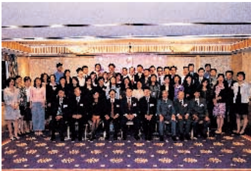
Cocktail reception held by the Society to welcome new members (March 2002) 公會舉行迎新酒會，歡迎新會員 (二零零二年三月)