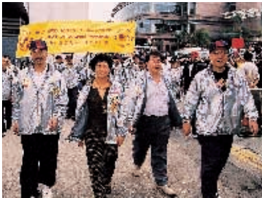
HKSA Charity Walk (December 2001) 香港會計師公會慈善步行籌款 (二零零一年十二月)