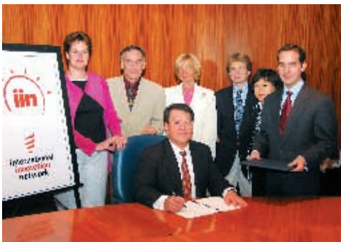
The President signing the IIN Charter and Master License Agreement at IIN's inaugural meeting in New York (July 2002) 公會會長在紐約舉行的IIN揭幕大會上簽署IIN憲章與總授權協議 (二零零二年七月)