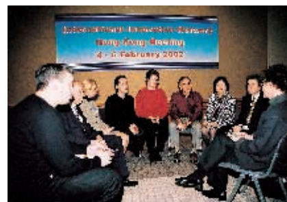
Exchanges between the International Innovation Network committee members (February 2002) 專業創新國際互聯組織委員會成員在交流意見 (二零零二年二月)