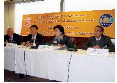
HKSA and Hong Kong International Arbitration Centre launched HKIAC Electronic Transaction Arbitration Rules (January 2002) 公會與香港國際仲裁中心合作推出香港國際仲裁中心之電子交易仲裁規則 (二零零二年一月)