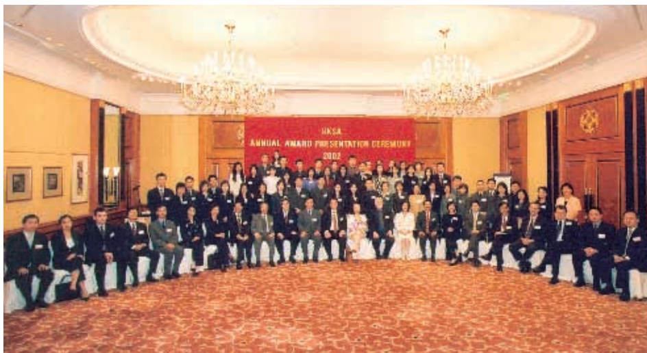
Annual Award Presentation to top students (May 2002) 舉行周年頒獎典禮以表揚優秀學生 (二零零二年五月)