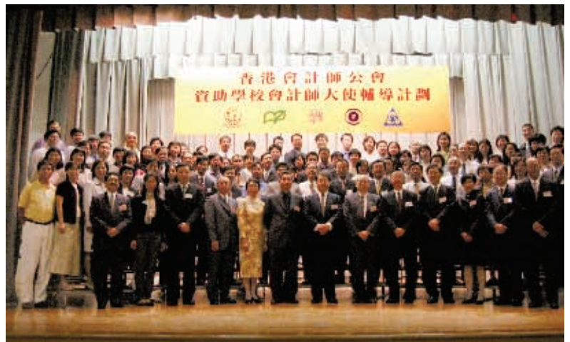
Launching ceremony of Accountant Ambassadors Programme for Aided Schools (October 2002) 資助學校會計師大使輔導計劃開展典禮 (二零零二年十月)