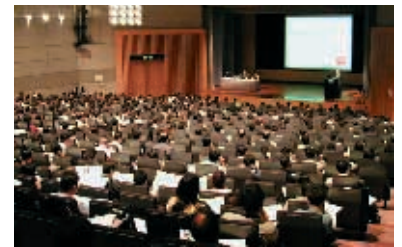
Annual Auditing Update Conference for members (May 2002) 為會員舉行年度核數會議 (二零零二年五月)