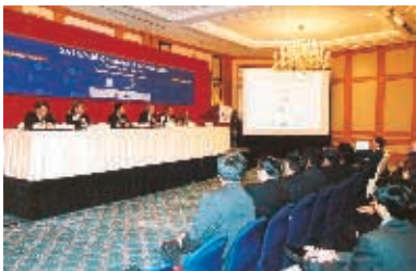
Press Conference on the 16th World Congress of Accountants in Beijing (March 2002) 第十六屆世界會計師大會北京新聞發布會 (二零零二年三月)