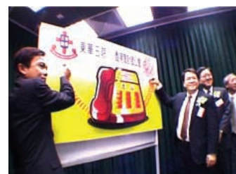
Launch of "Health Budgeting" Family Counselling Programme with the Tung Wah Group of Hospitals (June 2002) 與東華關懷熱線合辦「健康理財」家庭輔導服務 (二零零二年六月)