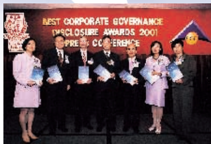
Best Corporate Governance Disclosure Awards results announcement press conference (October 2001) 最佳公司管治資料披露大獎比賽結果新聞發布會 (二零零一年十月)