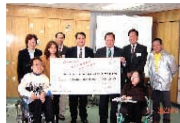
Charity Walk cheque presentation to the Society for the Relief of Disabled Children (February 2002) 捐贈慈善步行籌得善款予香港弱能兒童護助會 (二零零二年二月)