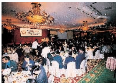
Members and guests enjoying at the Society's Annual Dinner (October 2001) 公會會員與嘉賓在公會周年晚宴上共晉筵席 (二零零一年十月)