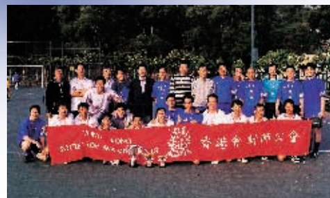
Football competition with Inland Revenue Department (December 2001) 與稅務局進行足球比賽 (二零零一年十二月)