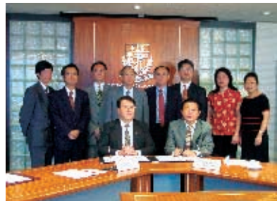
HKSA enters into Memorandum of Cooperation with Hubei Institute of CPA (May 2002) 公會與湖北省註冊會計師協會簽署合作備忘錄 (二零零二年五月)