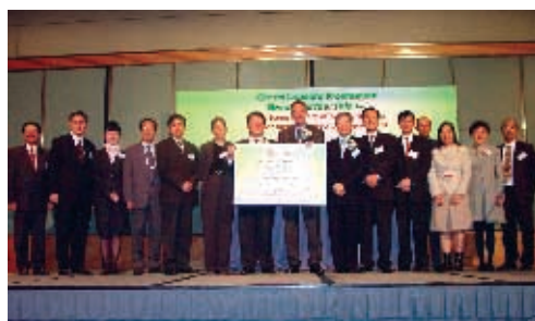
Launch of the Green Leaders Programme - Green Partnership with Environmental Protection Department (January 2002) 與環境保護署攜手開展綠色領袖計劃 - 綠色夥伴 (二零零二年一月)