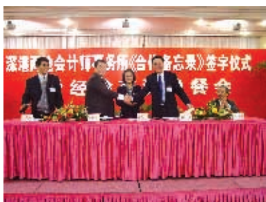
HKSA signed Memorandum of Cooperation with the Shenzhen Institute of CPA (January 2002) 公會與深圳註冊會計師協會簽署合作備忘錄 (二零零二年一月)