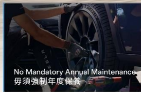
No Mandatory Annual Maintenance 毋須強制年度保養