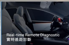
Real-time Remote Diagnostic 實時遙距診斷