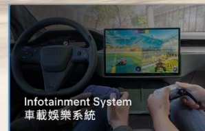
Infotainment System 車載娛樂系統

Tesla is committed to supporting the popularisation of electric vehicles by offering exclusive Green Mobility Privileges to you. 為致力支持推動電動車普及化，Tesla 為你提供專屬綠色交通禮遇。